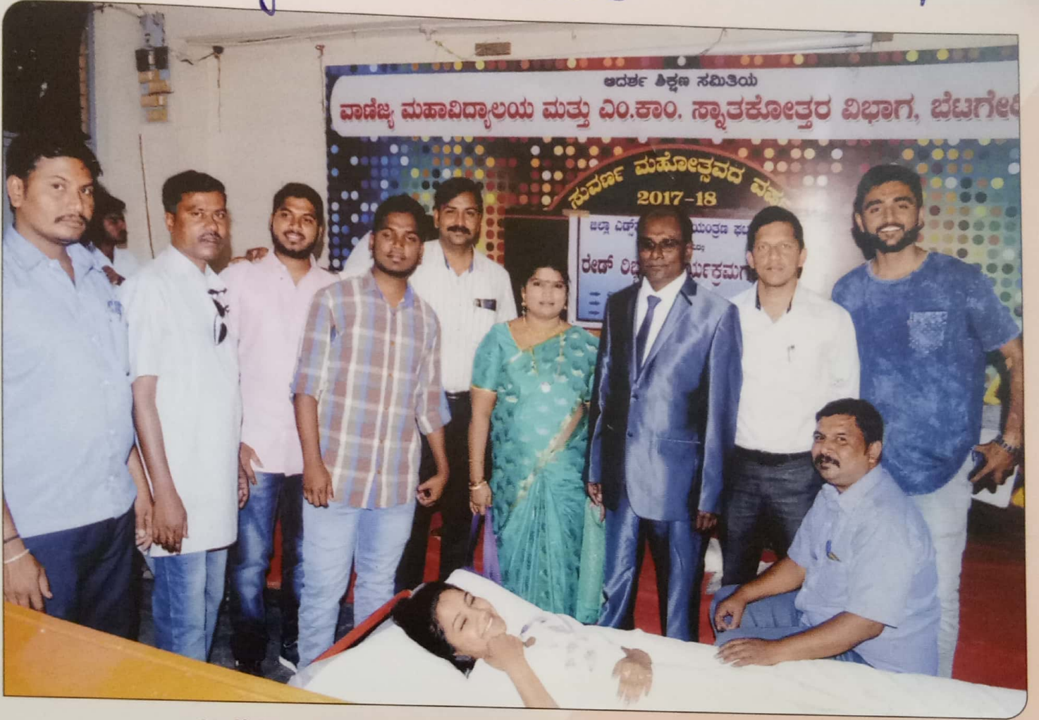
Staff Members and Students at the Blood Donation Camp Organised by RED CROSS Department

Q NO: 3.4.3.1 ; Blood donation Camp for the year 2017-2018