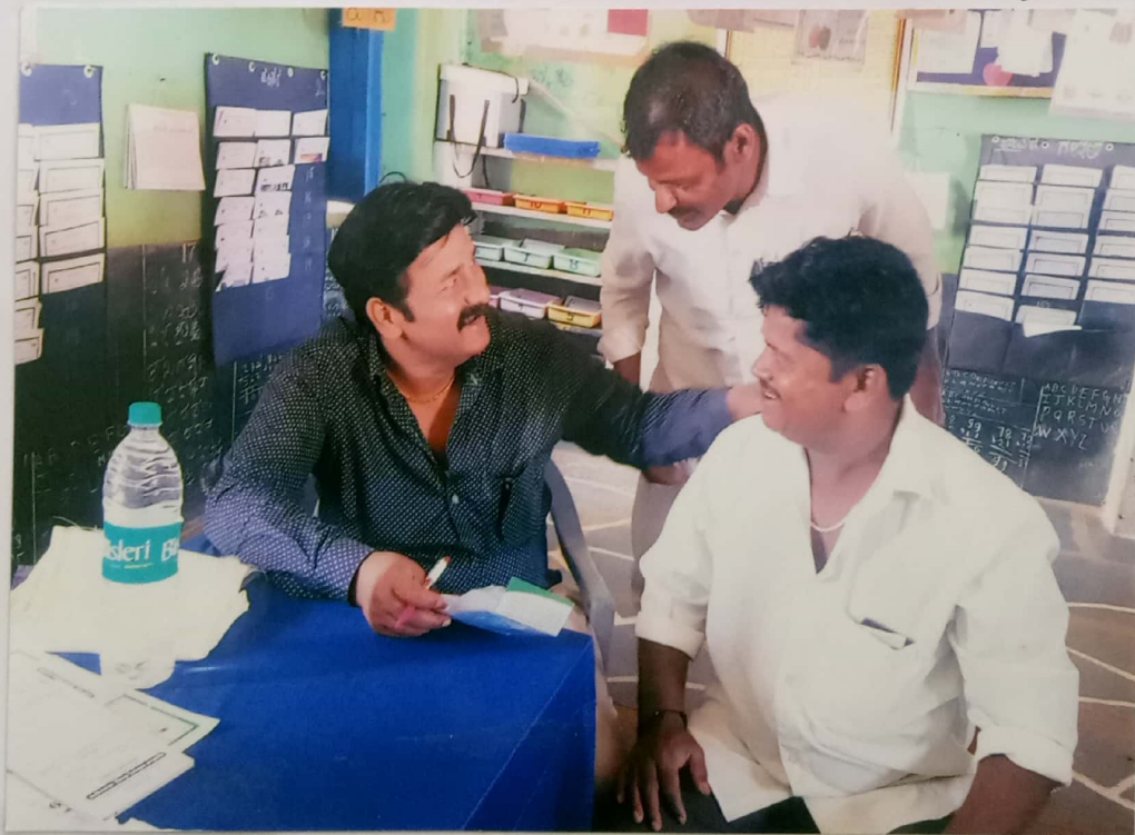
Doctors checkup for the village patients.